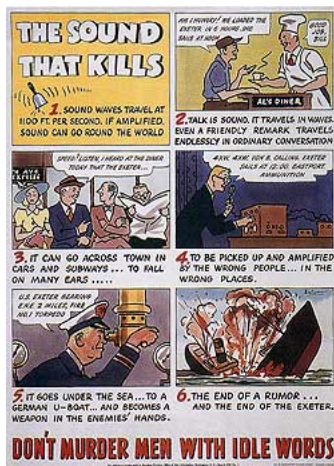
1942 Office of War Information poster warning against the careless leaking of sensitive information.

Information (OWI) in June 1942. Among its responsibilities, the OWI sought to review and approve the design and distribution of government posters. Eventually, contending groups within the OWI clashed over poster design. While some embraced the poster to demonstrate the practical value and utility of art, others hoped to use the poster to demonstrate the power of advertising.