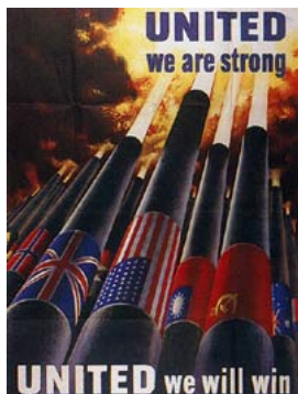
1943, Office of War Information

(WPB) specialized in production-incentive images for factories. The WPB led the way in contracting for posters with commercial illustrators and designers.[7] Distributing posters and streamers free for the asking, the WPB only asked in return that factory managers “select your posting spots with care, and stick to these posting spots . . . use your imagination in displaying posters and in building up exhibits composed of two, three, or a dozen different kinds of posters.”