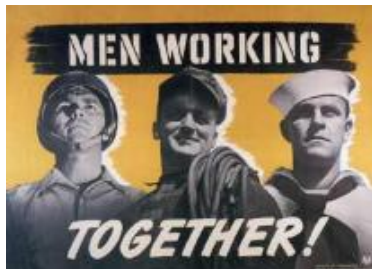
1941, US Office for Emergency Management, Division of Information